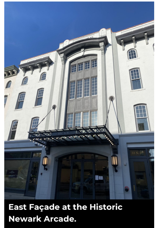
East Façade at the Historic Newark Arcade.