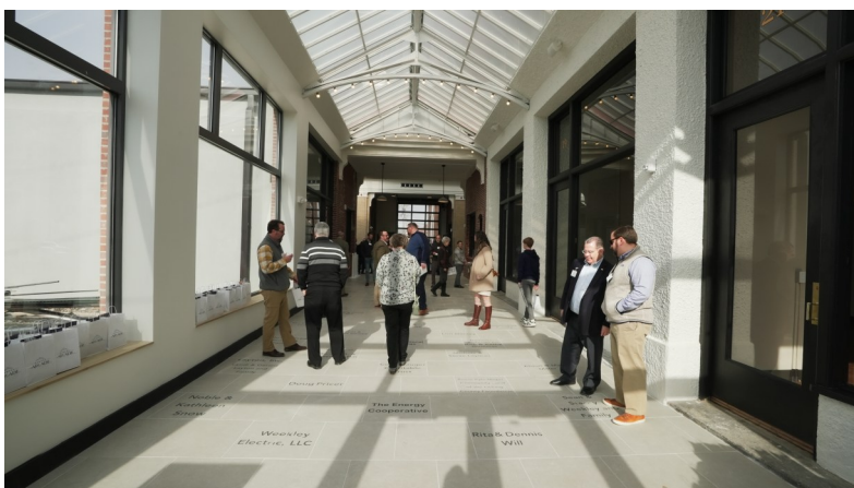
Donors at the Donor Appreciation Brunch on January 25, 2025.