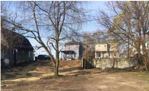
PROPERTY CLEANUP ON ELMWOOD AVENUE