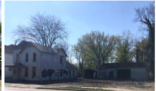
PROPERTY CLEANUP ON WEST MAIN STREET [AFTER]