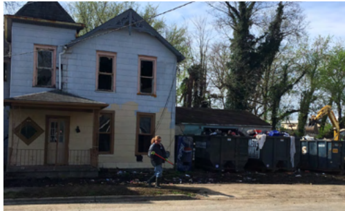
PROPERTY CLEANUP ON WEST MAIN STREET [BEFORE]